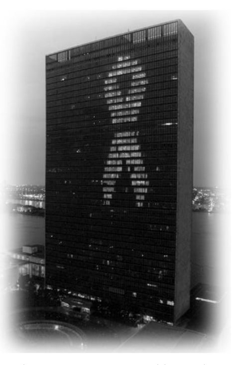
The UN Secretariat Building is lit to resemble a giant AIDS ribbon in June of 2001.

The Codex Alimentarius, or "food code," dates from 1961 and is a joint project of WHO and FAO. The Codex Alimentarius Commission, while nonbinding on Member States, has played a significant role in formulating and harmonizing standards for consumers, food producers and processors, and for both national food control agencies and international trade in food, including the development of codes governing hygienic processing, and makes recommendations on compliance with them. The Codex standards have become a worldwide benchmark against which national food measures and regulations are evaluated.