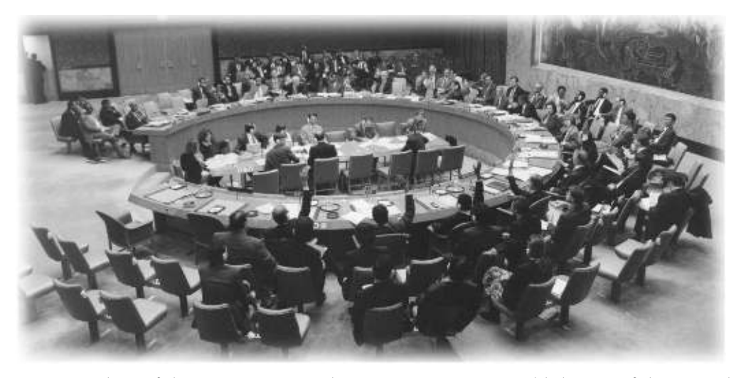
Members of the Security Council are seen approving establishment of the United Nations Angola Verification Mission (UNAVEM III) on February 8, 1995.

Sadly, the tribunals and Compensation Commission demonstrate that Security Council decisions are, to a large degree, case-by-case and enforceable only against relatively small and weak or defeated states, and only then when the Permanent Five choose to exert the necessary pressure. Thus, the actual powers of the Council, debated at length in San Francisco and spelled out in the Charter, only sporadically come into play as envisaged, and even then often in a weakened and compromised fashion, a far cry from what was foreseen at the creation of the United Nations.