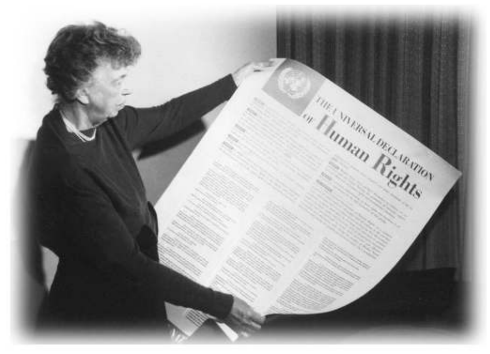
Eleanor Roosevelt examines a Universal Declaration of Human Rights poster in November of 1949.