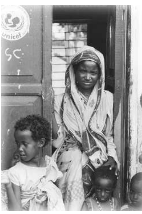
A Somali mother and her children wait for medical treatment in the doorway of a clinic run by UNICEF in October of 1992.

ing the lot of children in the 1990s.<sup>49</sup> This process demonstrates a "best case scenario" of a successful UN effort. Research and field experience combine to define the problem and outline reachable solutions. When intergovernmental mechanisms come into play, leaders must avoid setting goals at the lowest common denominator if their decisions are to have any value. In the case of UNICEF, it was just the opposite: The goals were very ambitious and were also expressed in quantitative and measurable terms. These goals became the basis for national plans of action, with the relevant agencies and programs providing advice in drafting or revising the plans, technical assistance in implementing them and, where available, funding. Targets were set - Richard Jolly, former acting director of UNICEF, characterizes them as "baseline human goals" and, over subsequent years, assessments were made of progress toward goals undertaken.<sup>50</sup>