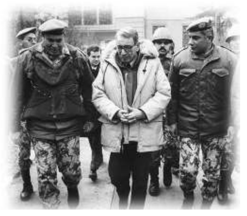
Former Secretary-General Boutros Boutros-Ghali toured Bosnia in December of 1992, accompanied by peacekeepers from Egypt.

Security Council any matter which in his opinion may threaten the maintenance of international peace and security" (Article 99). In fact, this provision has had little impact. Of far greater importance has been the provision in Article 98 that the Secretary-General "shall make an annual report to the General Assembly on the work of the Organization."<sup>25</sup> Successive Secretaries-General have increasingly utilized this report, issued at the opening of the regular session of the General Assembly each September, to identify what they felt were the major issues and concerns facing the Organization, thus seeking to define its future agenda and to influence