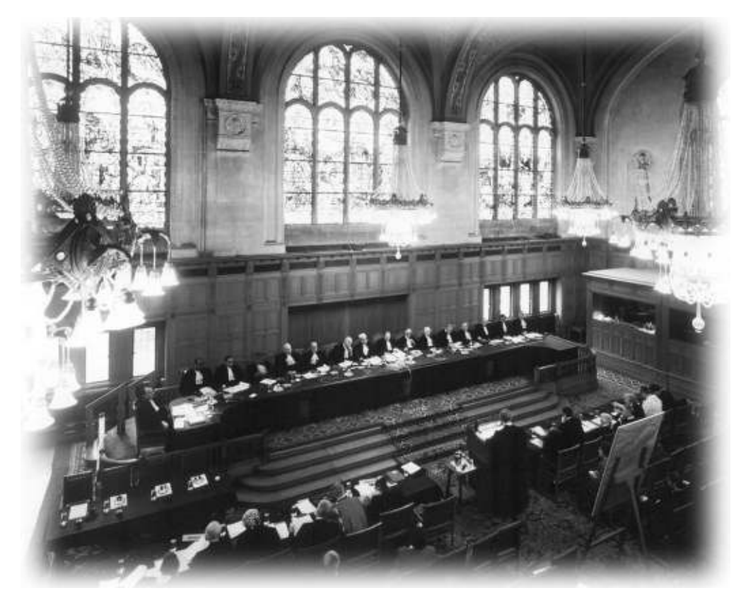
International Court of Justice meets in The Hague.